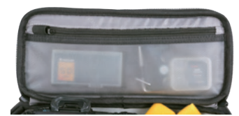
Inner Secured Zip Pocket