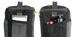
Mesh Pockets on the Side