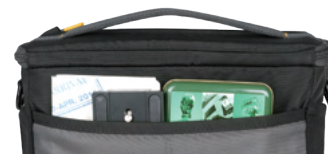
Front Secured Zip Pocket