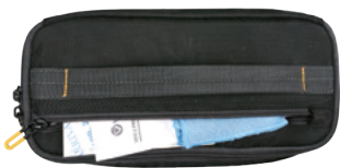
Top Secured Zip Pocket